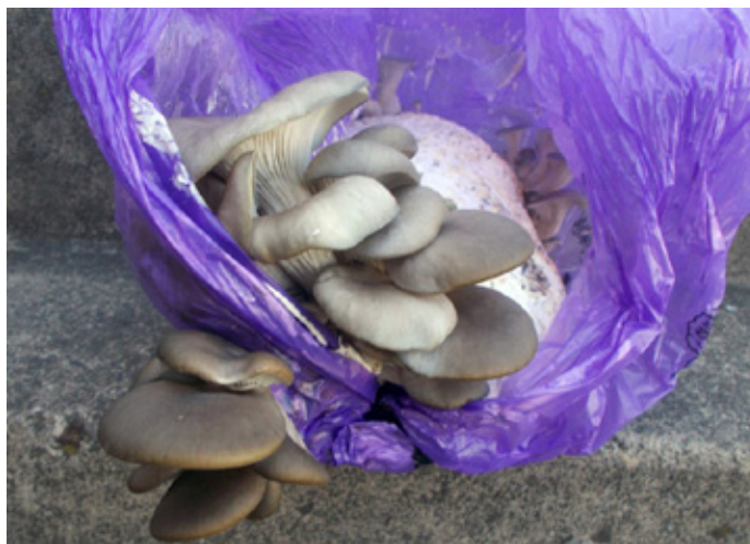
At the May monthly meeting mushroom kits were distributed to all the members.