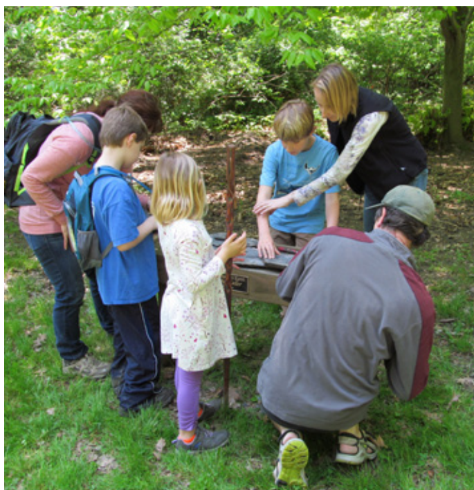
Dark Hollow mushroom walk participants.